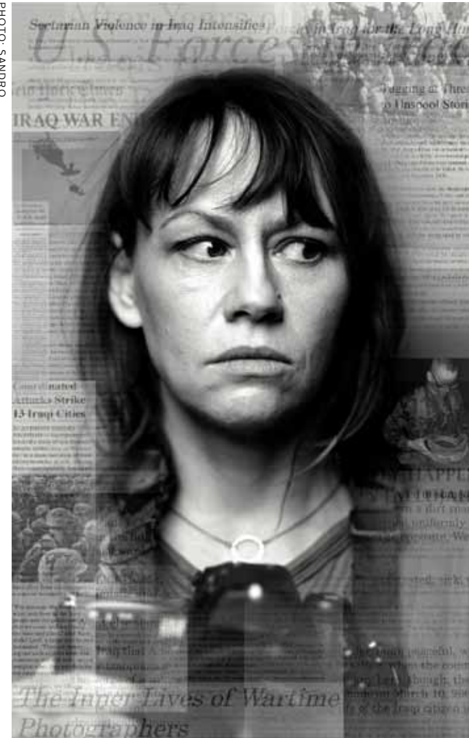
Time Stands Still

“This Nearly was Mine,” and “I'm Gonna Wash That Man Right Out of My Hair.” The bonus this year? The production, a classic romance of shifting alliances set during World War II, is based on the 2008 Tony Award-winning production from the Lincoln Center. TICKETS: $18-$85. CADILLAC PALACE THEATRE, 151 W. RANDOLPH ST., CHICAGO, 800/775-2000