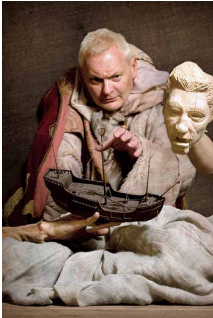
The Feast: An Intimate Tempest

ABBA. Expect romance, the occasional shiny sequin and, of course, hits like “Dancing Queen,” “S.O.S. and “Super Trouper.” PRICES: $18-$85. ORIENTAL THEATRE, 24 W. RANDOLPH ST., CHICAGO, 800/775-2000