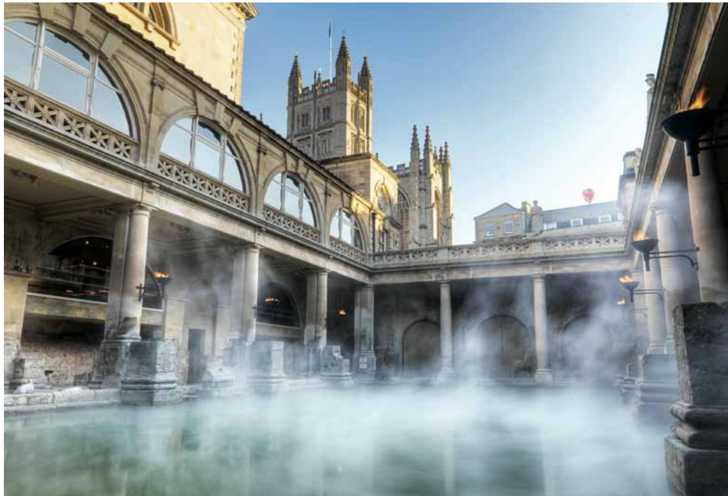
These hot springs inspired the Romans to develop Bath as a city of recreation in A.D. 43. A temple, dedicated to the goddess Minerva, was built alongside the baths and this area formed the Aquae Sulis.