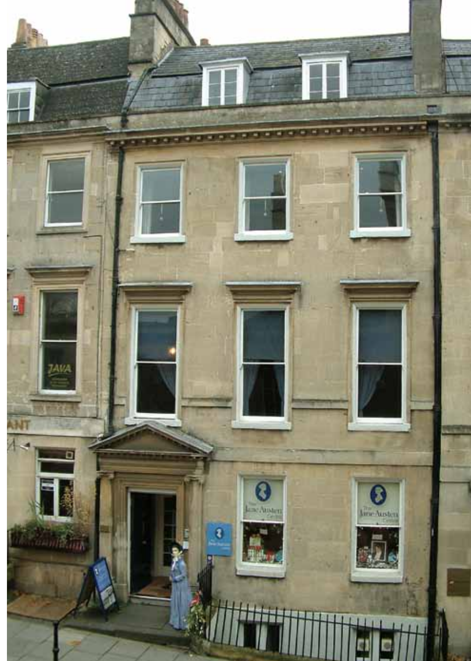
Jane, herself, lived very close to the Jane Austen Centre in 1805, higher up the hill at No. 25 Gay St. This and other landmarks can be seen on the Jane Austen city walking tour that meets daily at the KC Change Visitor Info Centre.