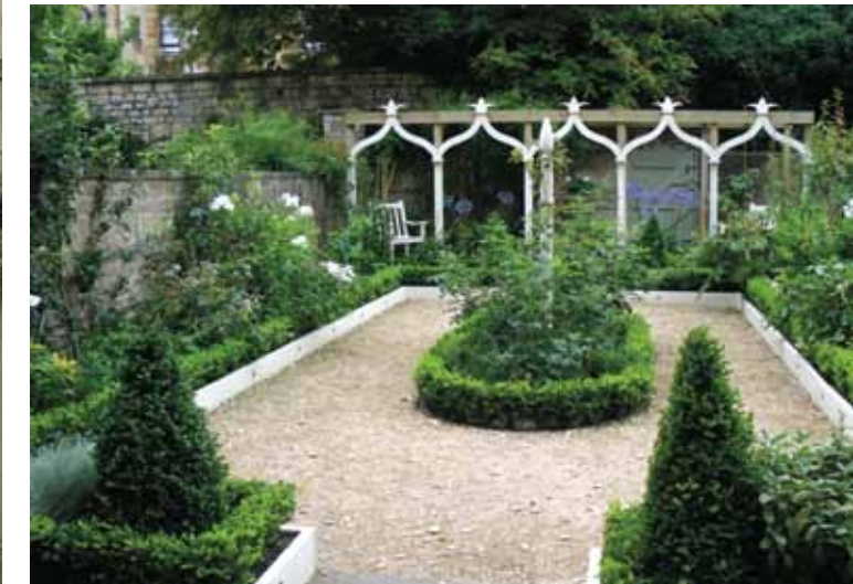
The Georgian garden at The Kennard on Henrietta Street was inspired by Jane Austen’s letters and novels. It is open for the enjoyment of all guests staying at the 1794 hotel.